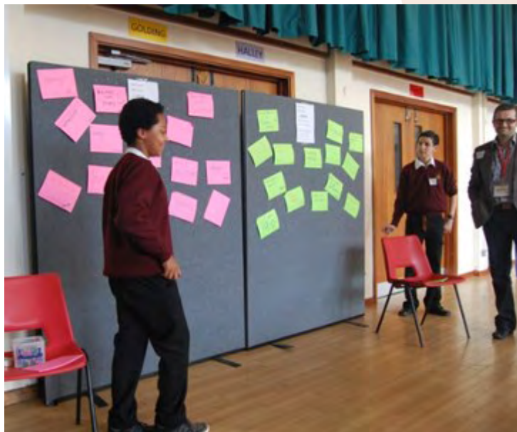
Figure 1. Introductory thoughts and feelings

The panels generate positive feelings for the pupils, with other comments (including from one of the team that made them happen) including 'proud', which reflects the amount of work put into the project.