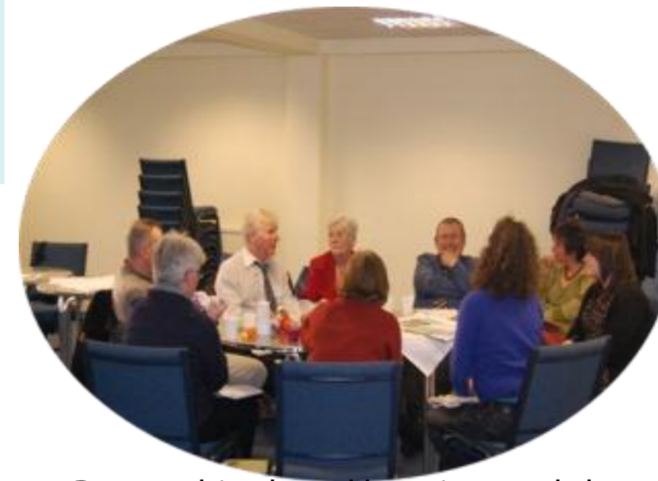
Partnership shared learning workshop