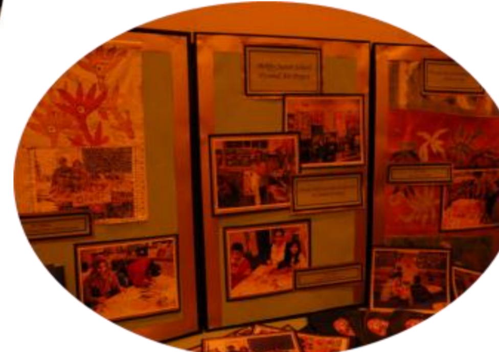
Community celebration & fuel poverty event at Kirklees council