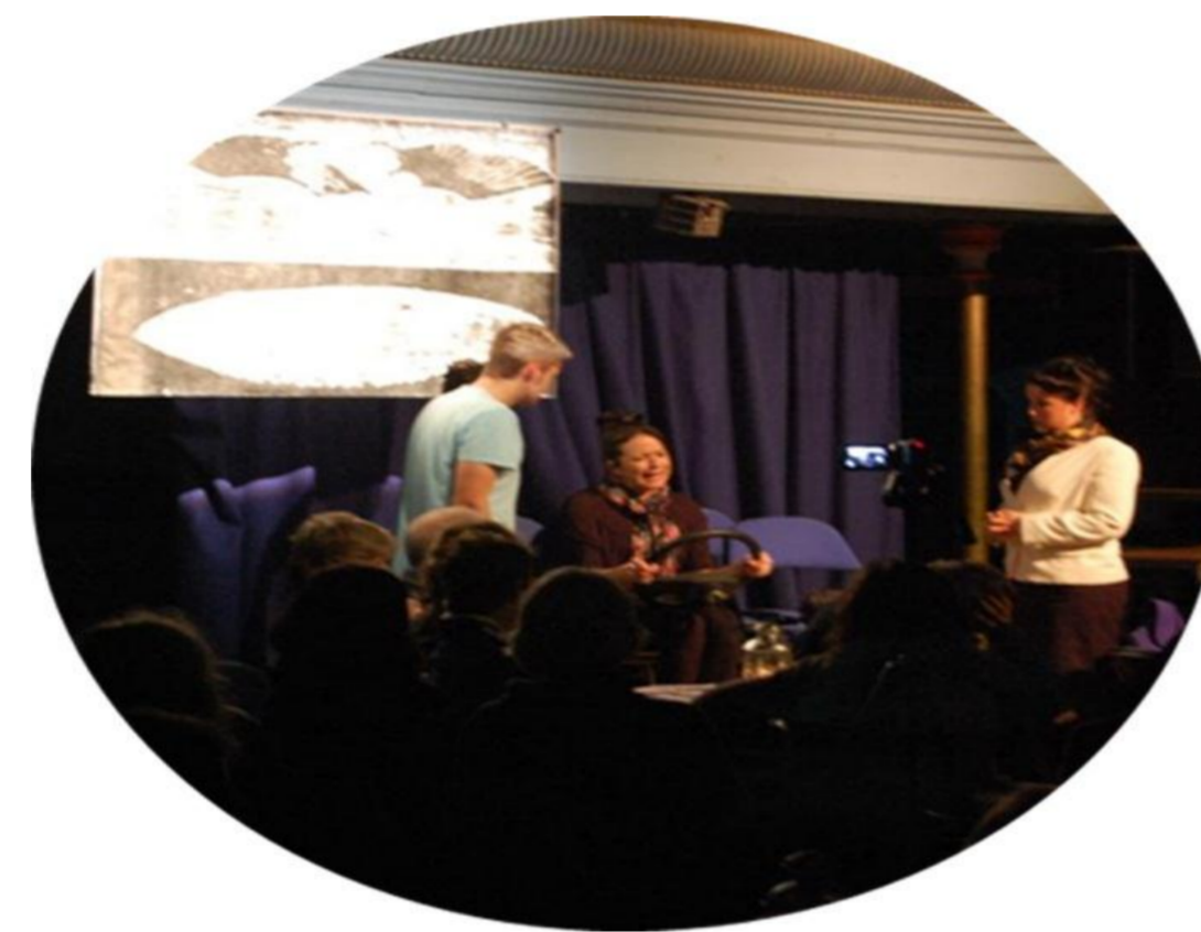
Arts and climate change event, at Awel Aman Tawe